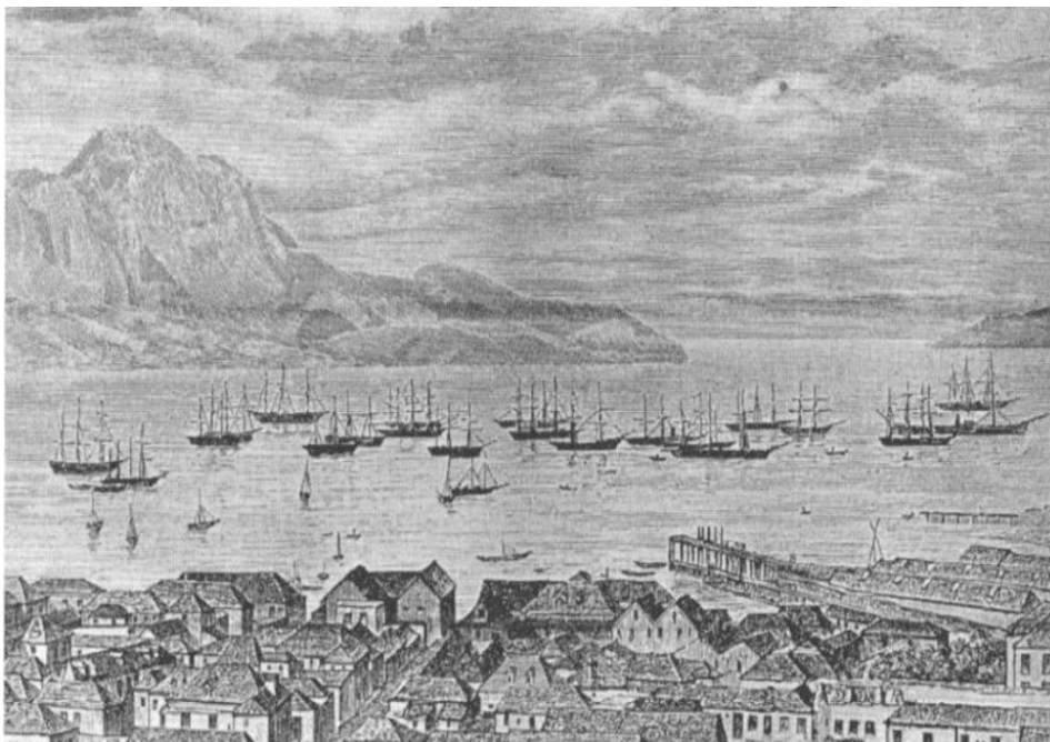
Figure 6 – Harbour of Porto Grande, Island of St. Vincent, Cape Verde Islands (Silveira, Iconografia ; original 1888, public domain)

Santiago, and by extension the Cape Verde Islands as a whole, thereby differ in their economic history from Madéira or São Tomé. More than almost any other Atlantic island or group, the Cape Verdes owed what tiny value they had almost solely to their location, not their production. Therefore, the ruination of one crop ironically did not spell total economic collapse and did not call forth the search for a substitute. Never having reached even the temporary level of wealth that the other two islands did, Santiago had much less far to fall. And with a remarkable consistency, the islands continued, and continue, to do what they have done for over 600 years, export salt and people (ibid: 148-149).