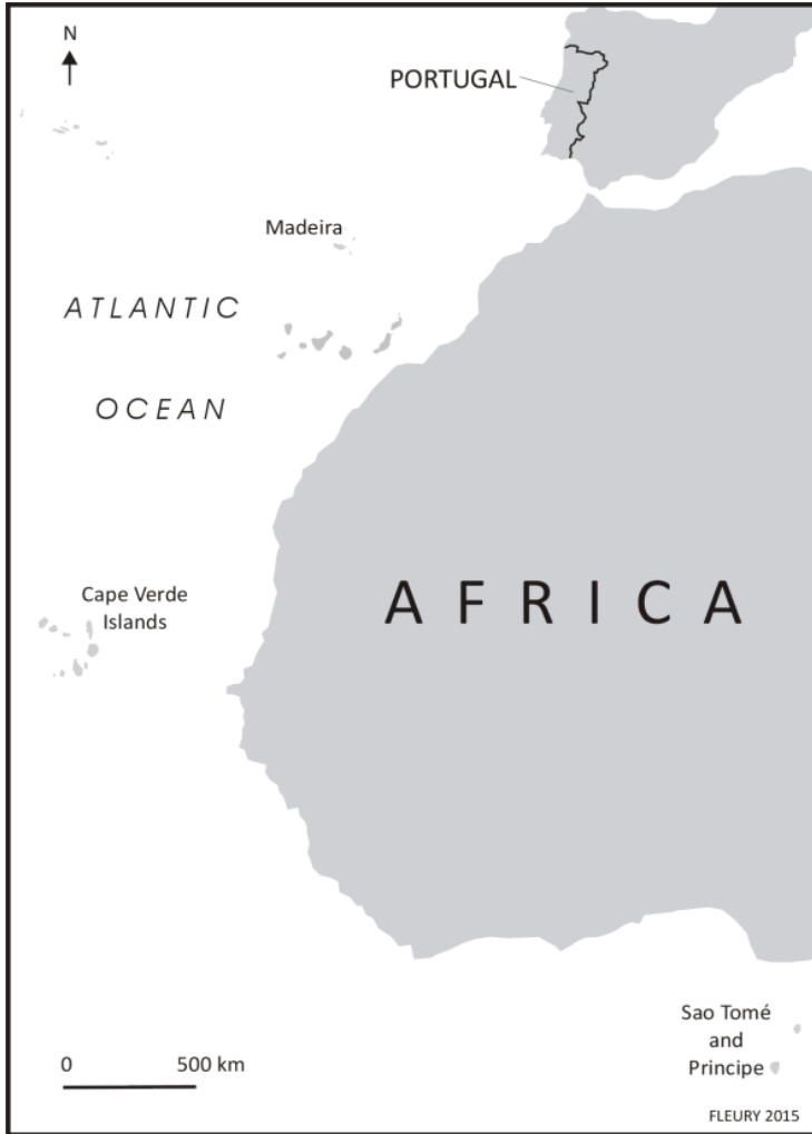
Figure 1 – Location of the Portuguese Eastern Atlantic Islands, Madéira, The Cape Verde Islands, and São Tomé, and their relation to the African mainland

Madéira was a good news, bad news island. Its soil was very fertile, its climate benign, and it had some adequate natural harbours, notably Funchal on the south-east coast. Unfortunately, it was also very rugged and mountainous, and just away from the coast there was hardly a flat piece of ground. The total area is only some 226 square miles (approximately 400 square kilometres) and much of that was so rugged as to be uncultivable by any method (Duncan, 1972: 25-27). In addition, there was no native population; the African slave trade had begun in the mid-15th Century, but more labour was provided by European immigrants from Portugal, Flanders and Italy than from slaves, at least until the early 1500s. To cultivate any crop required extensive terracing and the construction of elaborate irrigation channels to bring water from the central massif to the fields. Draft animals could not be used because of the quasi-vertical landscape, and so all cultivation was by hand, arduous back-breaking labour on