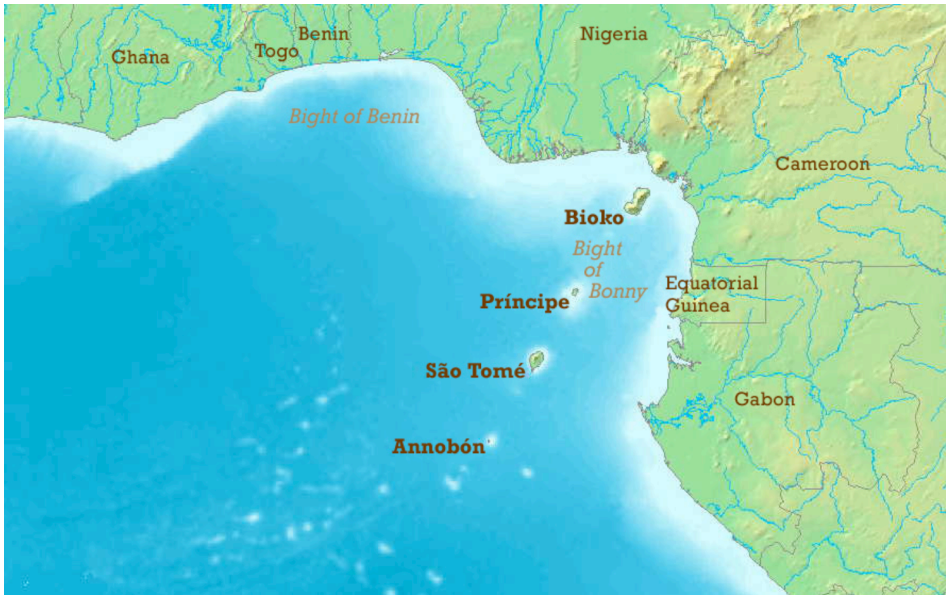
Figure 4 – The Islands of the Gulf of Guinea

As a result, the soil is almost excessively rich and the flow of water from the central massif makes the need for irrigation minor and simple (Tenreiro, 1961: 35-67). Thus, by the early 16th Century, most of the northern flatlands had been cleared and planted. And, the example of contemporary Madéira being at hand, most of the planting was in sugar cane. Unlike Madéira, however, the land was organized into large fazendas , or plantations; this was due to the far larger holdings made possible by the island's size and to the fact that almost no European labourers were brought to the island. The agricultural labour force was entirely African slaves, and such a regime economically and administratively demanded large holdings and severe control over the workers, both more easily accomplished on a plantation than on a family-based small holding.